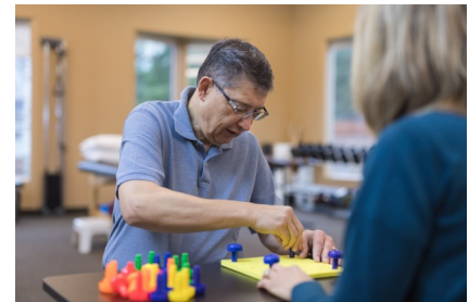
Rehabilitation Intensity Element 3 The patient was actively engaged in the activity throughout the session.