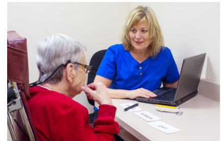
Rehabilitation Intensity Element 2 My activity with the patient was one-on-one (including co-treatment or collaborative treatment).