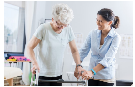
Rehabilitation Intensity Element 1 I was assessing, monitoring, guiding or treating the patient face-to-face.